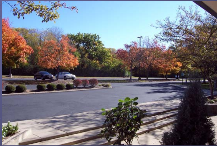
Car preparation/wash area