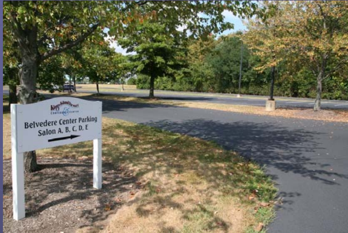
Parking area adjacent to conference center